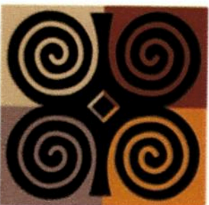
AFRICAN AMERICAN RESEARCH LIBRARY & CULTURAL CENTER

African American Research Library and Cultural Center 2650 Sistrunk Boulevard Fort Lauderdale, FL 33311